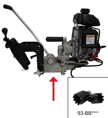
93-1010 RB28 works only with the Black Twister 150 RPM