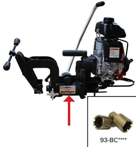
93-1045 RB35 works only with the Carbide Twister 350 RPM