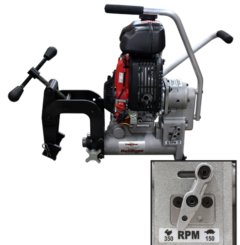
93-1005 RB2SPD is designed to work with both Black Twister 150 RPM and Carbide Twister 350 RPM

If customer wishes to use Carbide Bits with the RB28, please note that the RPM needs to be higher. Please adjust throttle spring accordingly (See below images)