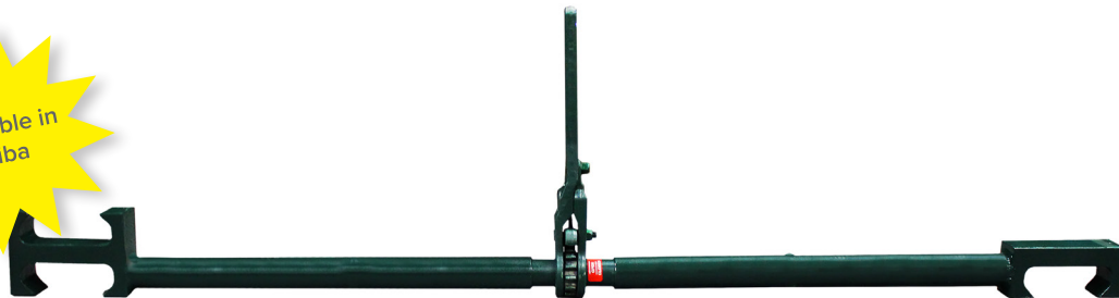
08-6050 TRACK GAUGE SPREADER, HEAD OF RAIL, NON-INSULATED