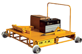
08-9860 / 08-9090

CART, TOOL & SUPPLY, STEEL BODY, 8" OR 5" ALUMINUM WHEELS,