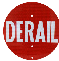
08-9010 / 08-6261