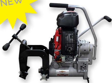
93-1005 DRILL, RAIL, GAS, RAILBOSS, 2 SPEED