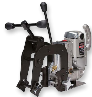
93-1080 DRILL, BONDING, ELECTRIC MODEL, BD17 - 120V (Other models available for signals & communication)